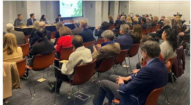
Ropes & Gray’s Boston office hosted nonprofit Green Pro Bono for panel in February.